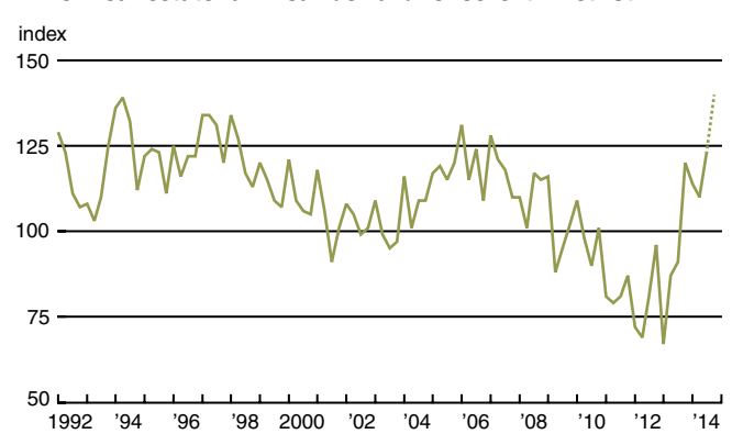
Notes: The dashed line including the final data point on this chart is a projection based on survey results. All other data are historical survey data.